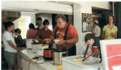
▲ The attendees helped themselves to the different styles of Chili, the side dishes and later some delicious desserts.