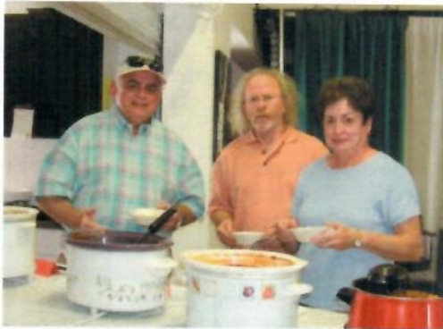
▲ The Chili Cook-Off Judges didn't even ask for Tums after completing their task.