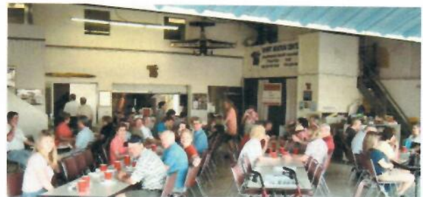
▲ The real winners – the members and family and friends who came to the Cook-Off and got to enjoy the food, fellowship and fun.