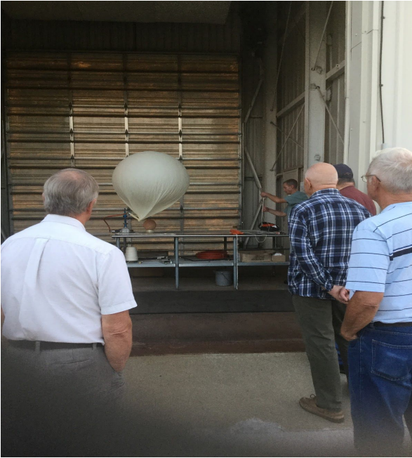
This is the process of filling the weather balloon with Hydrogen, which will lift the Radiosonde and collect data.