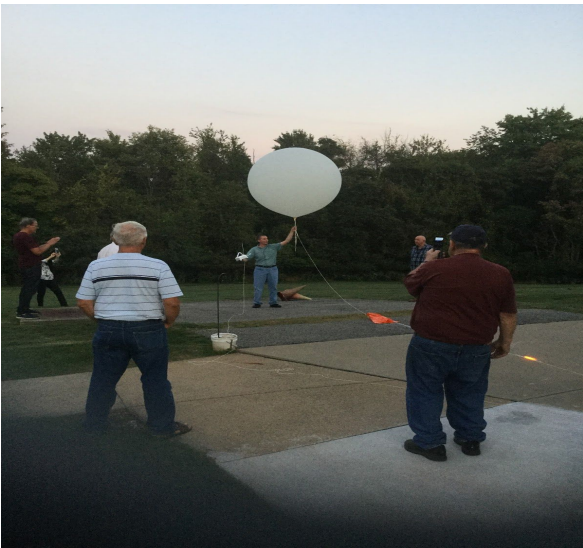
Ready for launch!!