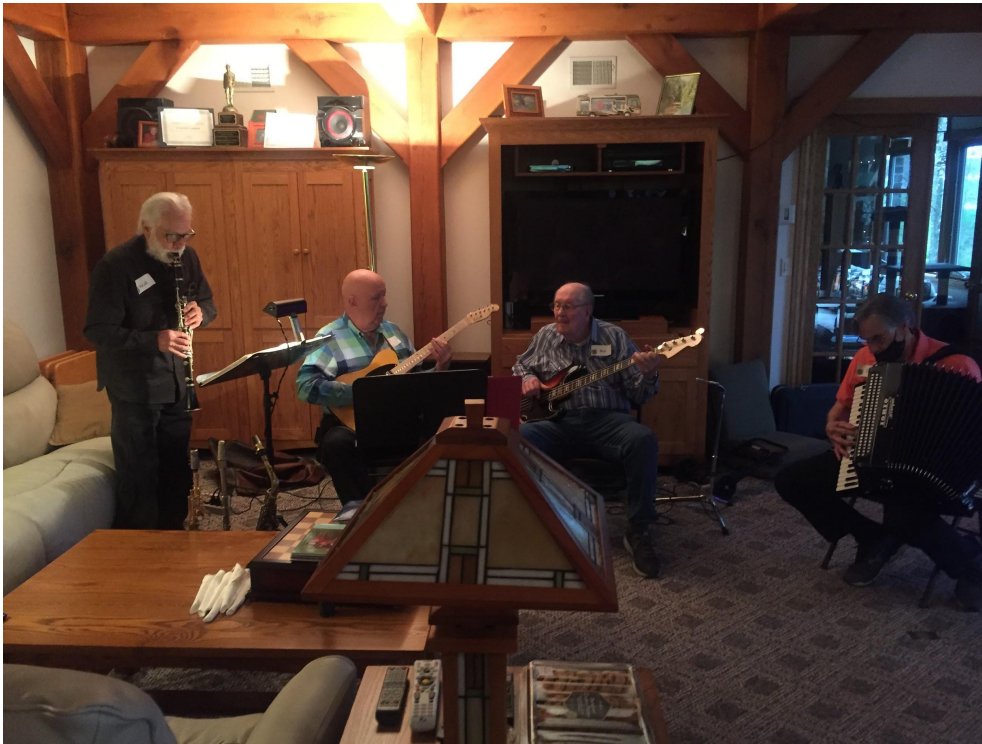
The “Boys in the band”