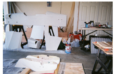
Custom built wheel pants of cardboard, plastic soap jug and paper mache