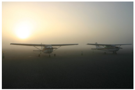
Fog lifted around 10:00 and 13 new Young Eagles were flown