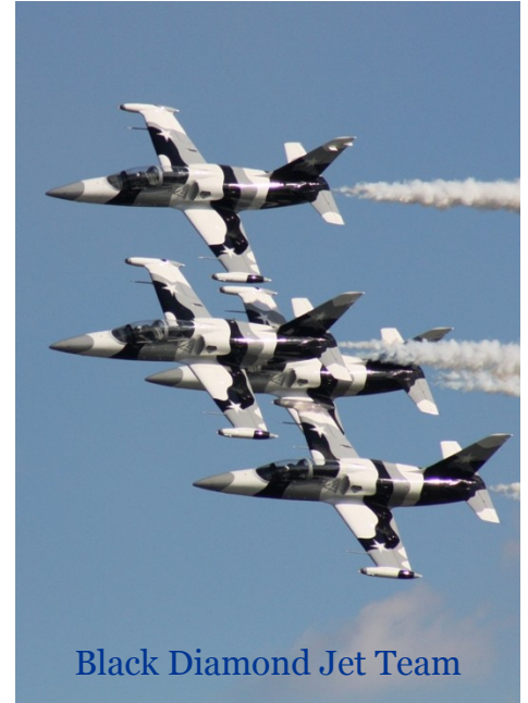
Black Diamond Jet Team