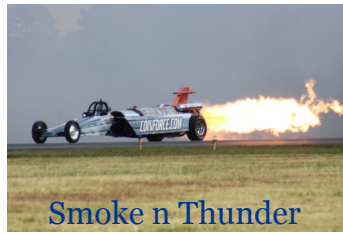
Smoke n Thunder