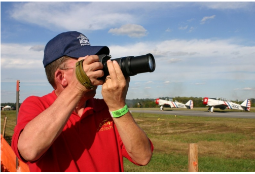
Acting like a Pro