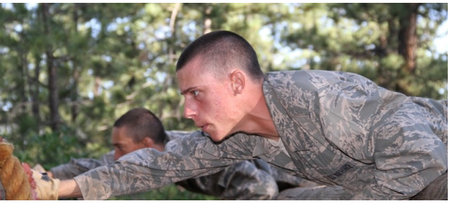
Hangar 13 News