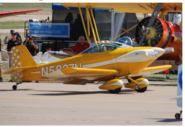
Rv-1 donated to the EAA