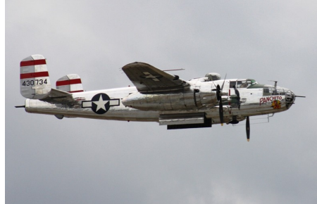
Beautiful DAV "Panchito" B25