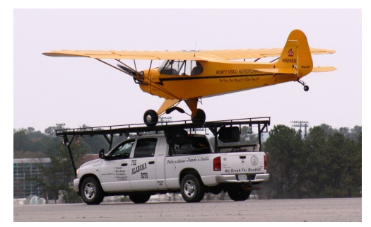
Koontz aircraft carrier landing