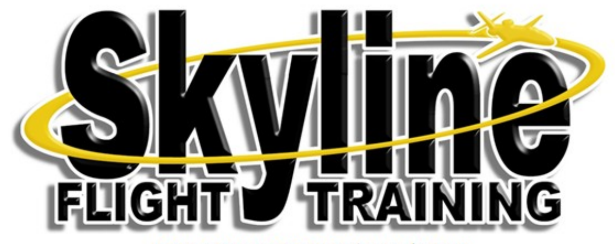
Columbus Georgia's Only Flight Training Academy