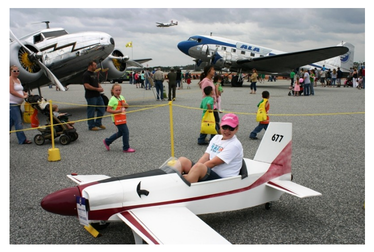
Sweeten P-1 was a hit with over 165 future pilots