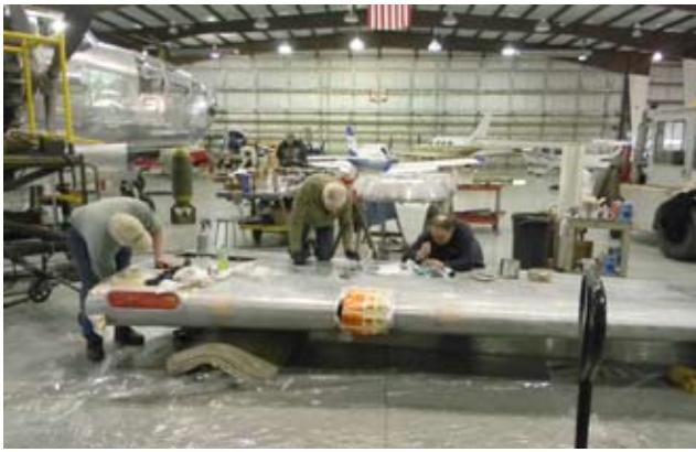
The cowl team also did the left wing work. An earlier work team had removed the wing.