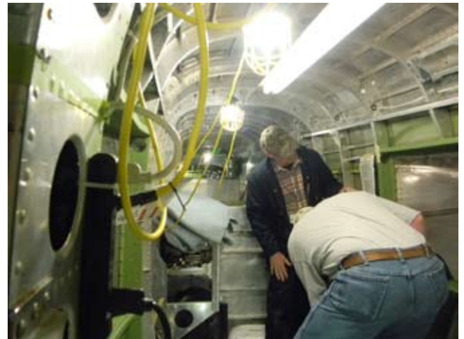
The above two workers are replacing some rivets. Their work station was right next to ours. When they fired off the rivet gun it gave us a startled surprise.