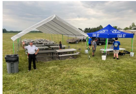
Pancake breakfast setup is ALWAYS a good time!