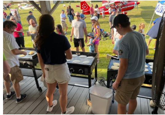
Excellent day. Huge crowds. The pancakes start here!