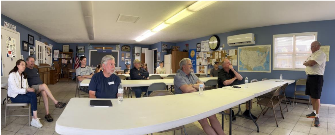
Good turnout at the VMC / IMC meeting.