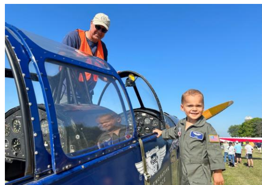
Our most important visitors look at the aircraft.