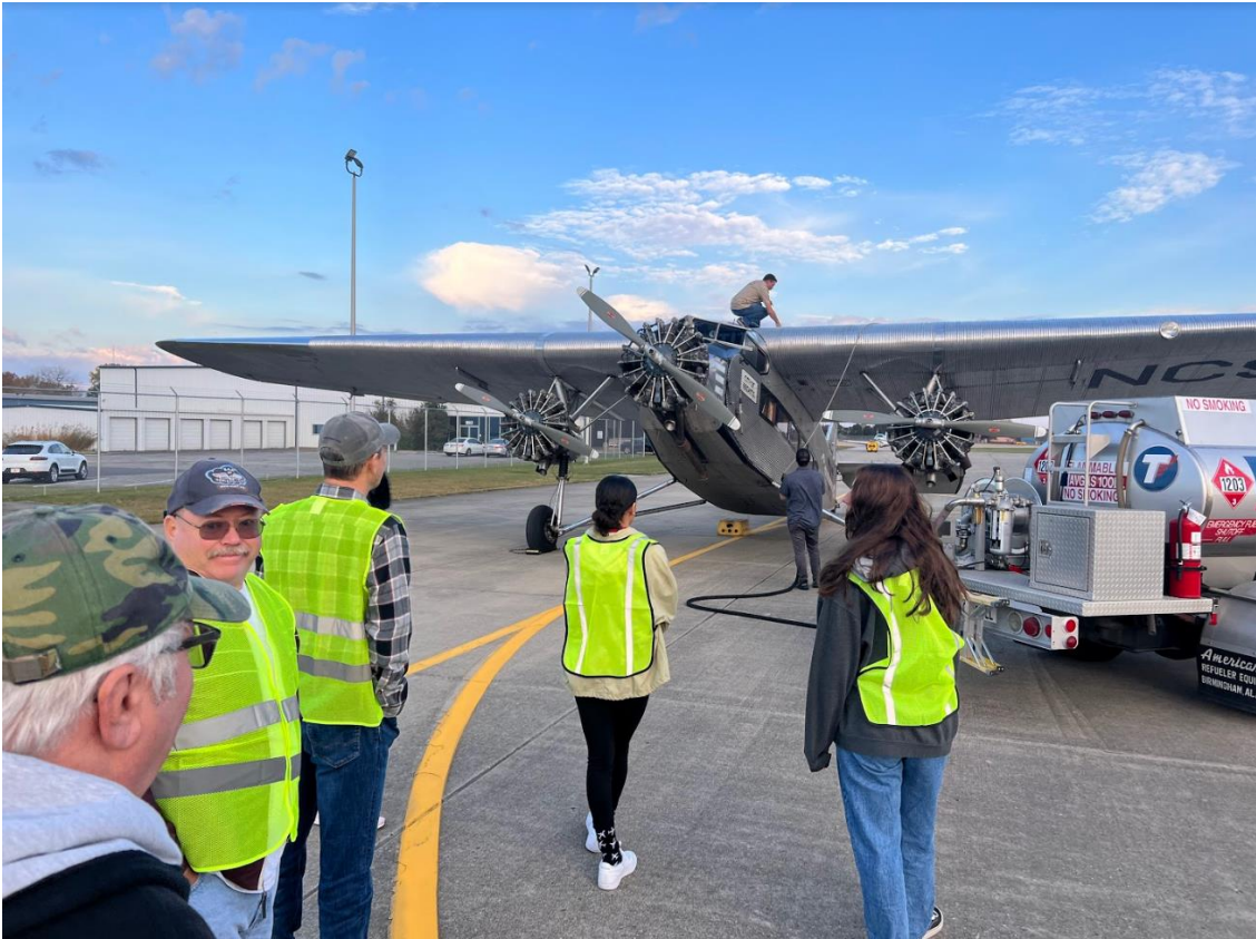
We had a good crew and lots of volunteers.