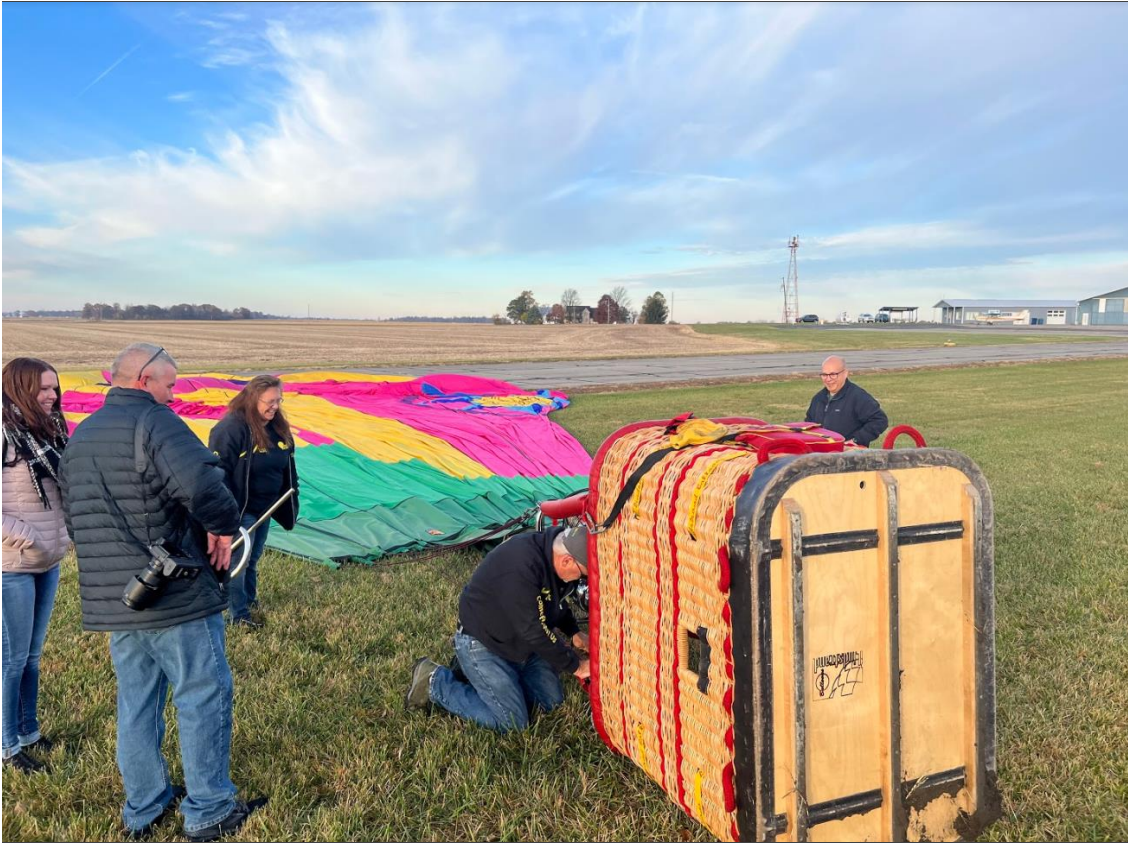
A balloon lands at Sheridan! Jodie will be doing a presentation about ballooning in an upcoming meeting.