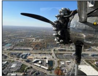
The skies over Carmel as seen from our publisher's seat aboard the 1928 Ford Tri-Motor on Thursday afternoon.