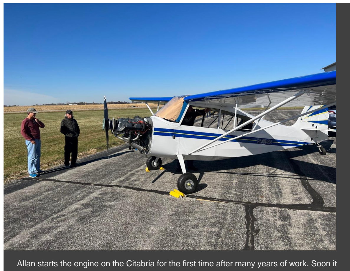
will be flying.