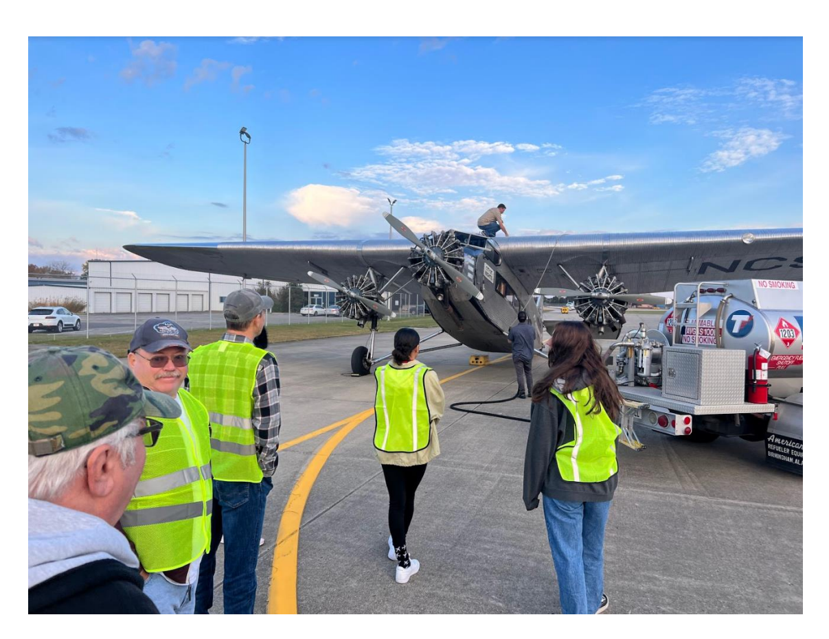
We had a good crew and lots of volunteers.