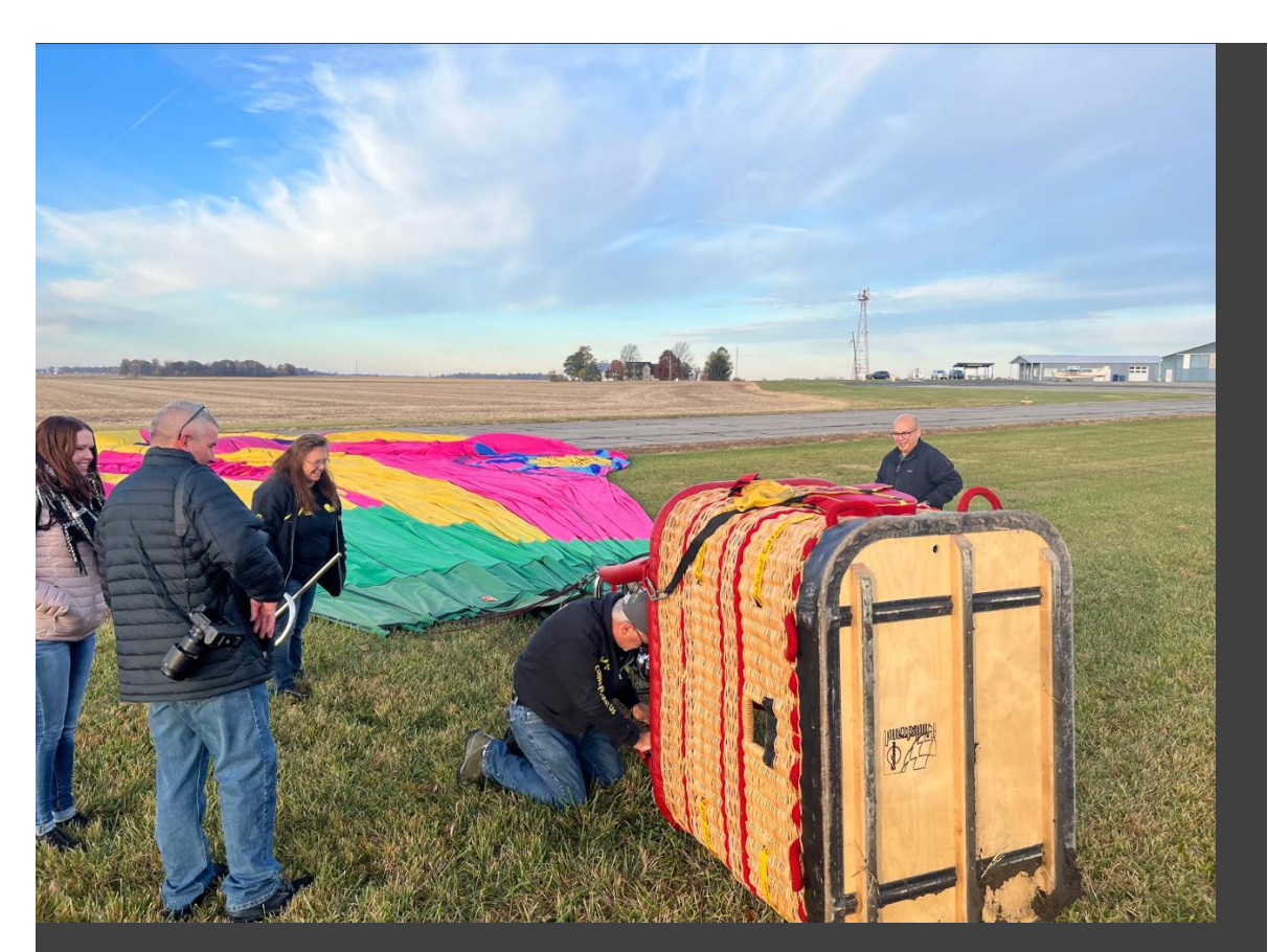
A balloon lands at Sheridan! Jodie will be doing a presentation about ballooning in an upcoming meeting.