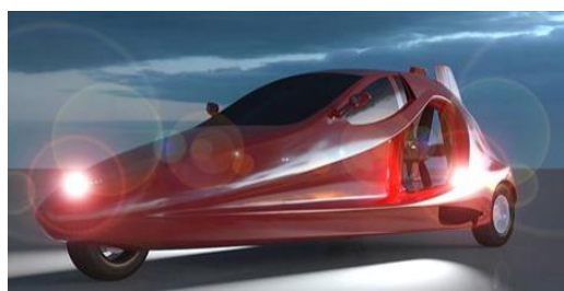
SWITCHBLADE UPDATE : 4 December, 2015 | Samson Motorworks