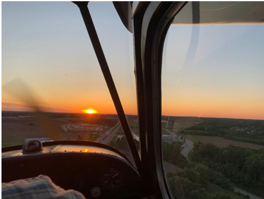
Turning onto downwind at Flying Dutchman right at sunset.