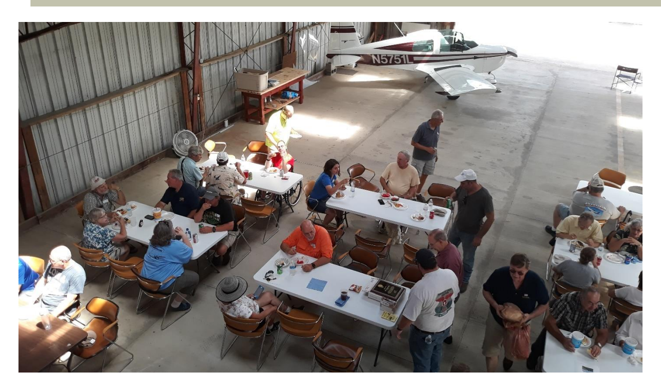
Chapter members enjoy potluck lunch inside the new Chapter Hangar.