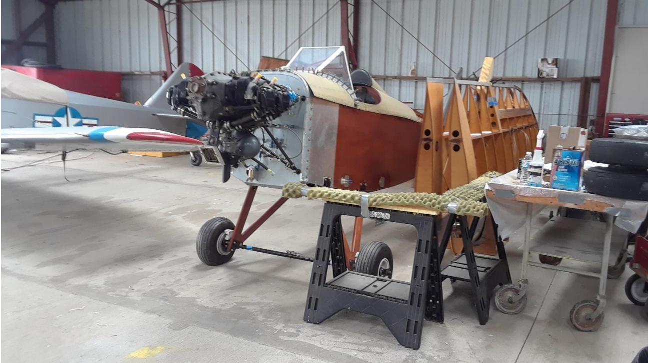
Al's Fly Baby project moved to new chapter hangar.