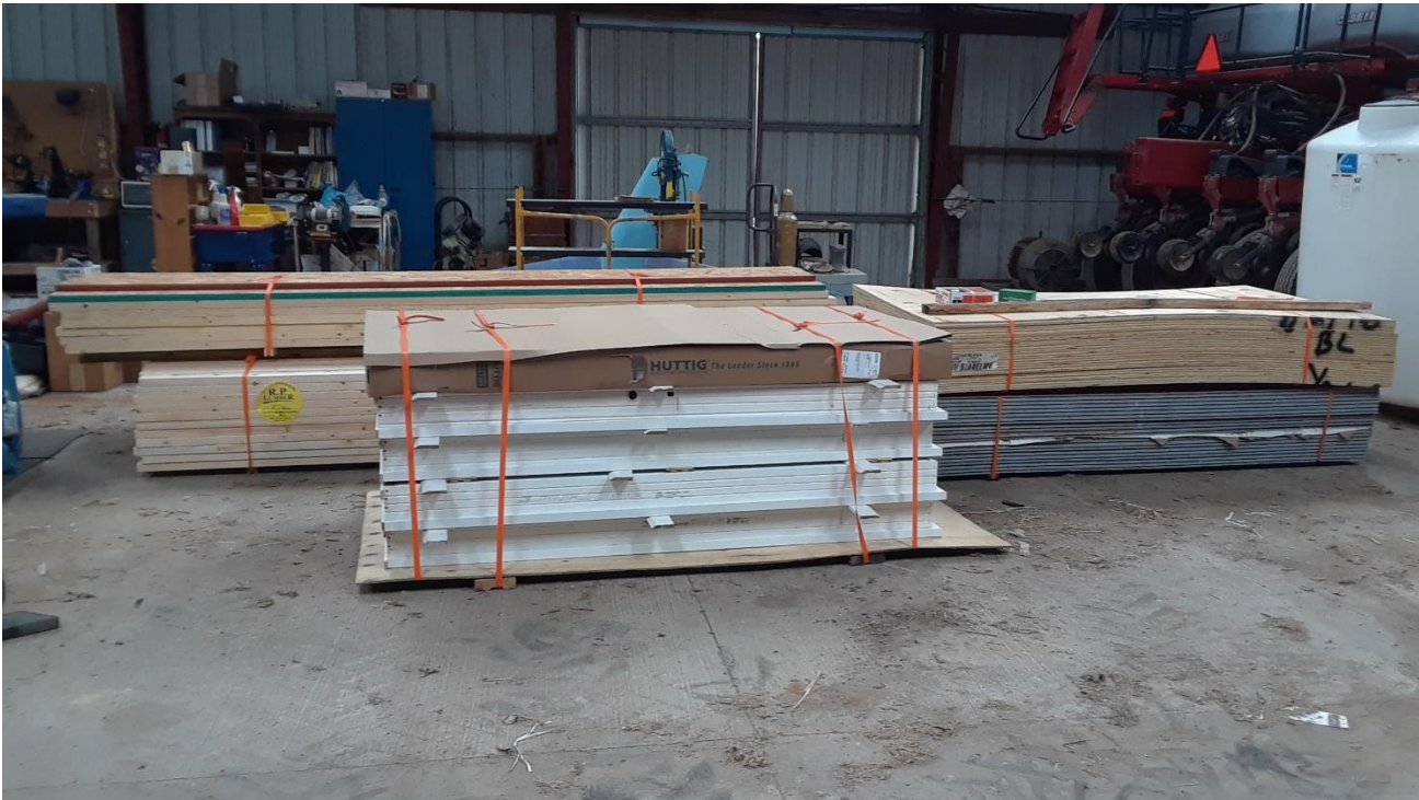
Construction materials for clubhouse in new chapter hangar.