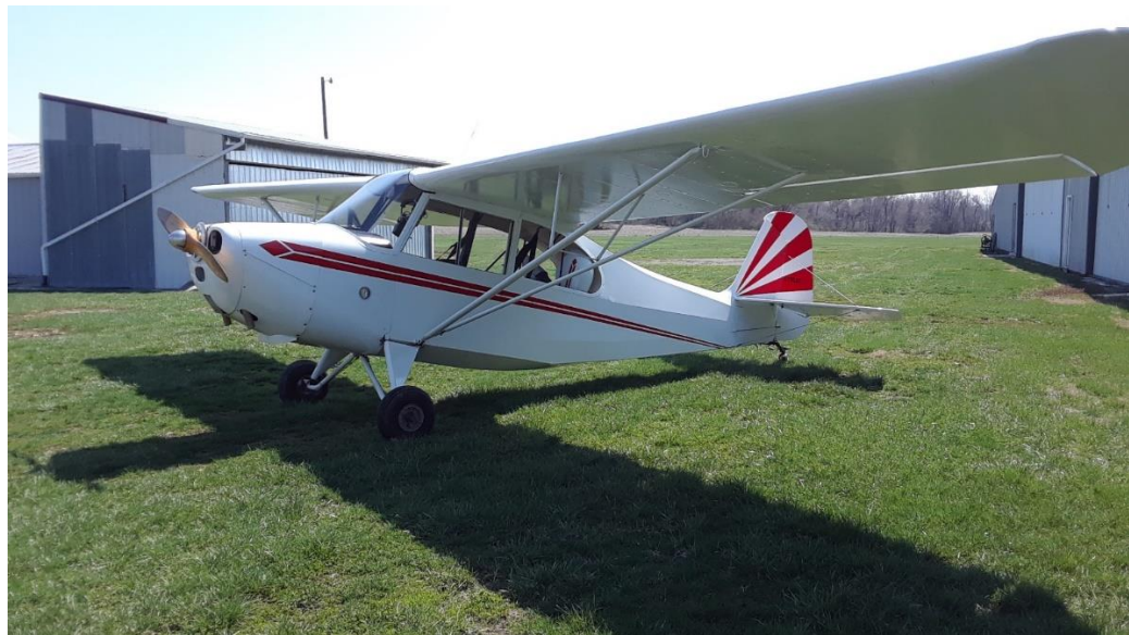
Al Bane's "new" 1946 Aeronca Champ