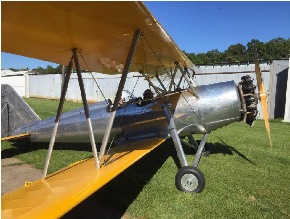
1940 Meyers OTW