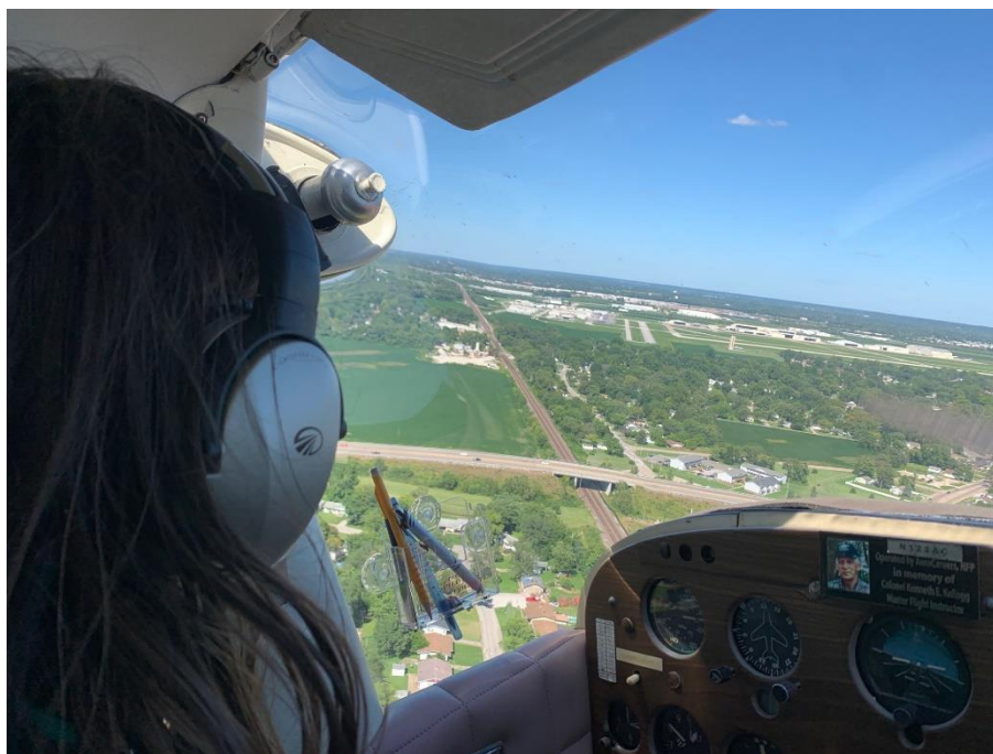
Amber turning final for Runway 5 at CPS after flight to glider club.