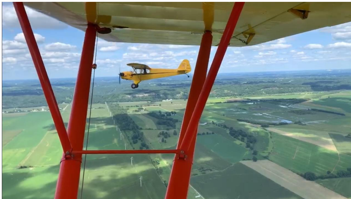
Flying along with an 18-year-old kid flying an 80-year-old J-3

I got several photos from Bill Aanstad featuring flying activities this summer.