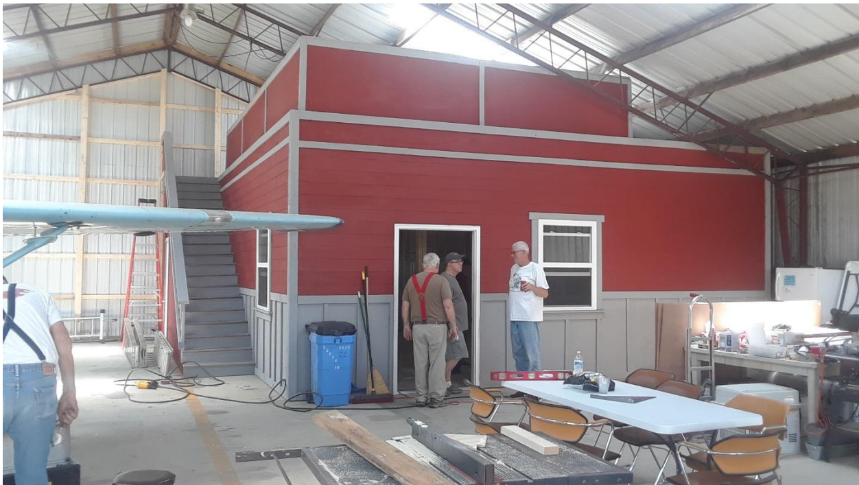
Great progress on new clubhouse/workshop!

This is probably more than you want to know about the system. The most important message here is PLEASE LOG ONTO THE SITE AND REGISTER.