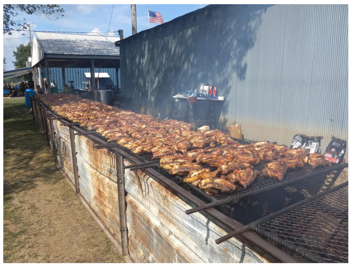
Chickens grilling at Brodhead.