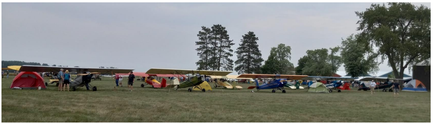
Nice turnout of Pietenpols at Brodhead this year.