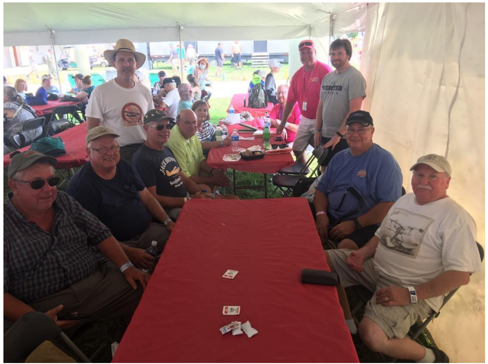
Chapter 64 was well represented at Oshkosh again this year. We all got together for lunch at the Warbirds food tent on Monday.