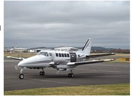
A Similar Bar Harbor Airlines Beech 99

This crash took the life of 13-year-old “Goodwill Ambassador,” Samantha Smith. She was famous for writing a letter to the Secretary of the Communist Party of the Soviet Union expressing her worry about the Soviet Union and United States getting into a nuclear war. Secretary Yuri Andropov invited her to visit the Soviet Union thus gaining her international attention, roles in Disney films, and a role in a British TV series. She was returning to her home in Maine from England with her father when her flight, Bar Harbor Flight 1808, crashed short of the runway at Auburn-Lewiston Airport in Maine killing everyone on board.