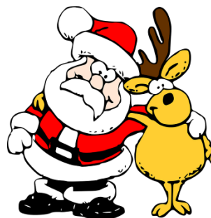
Jeez, we almost missed it