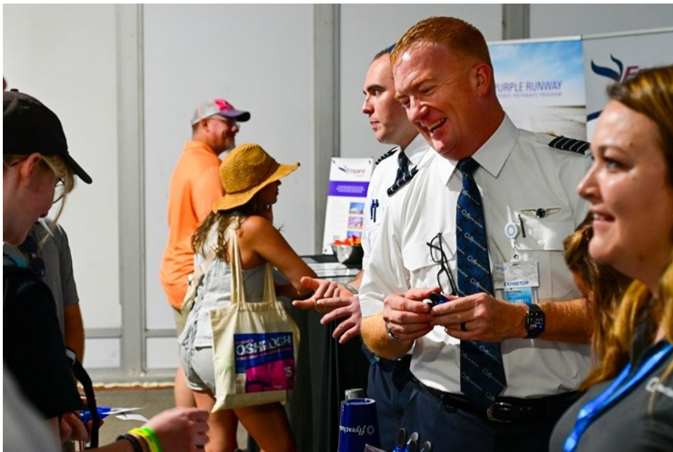
Pilots with the flyExclusive private jet firm answer questions during an aviation job fair at EAA AirVenture Oshkosh in Wisconsin on July 24.