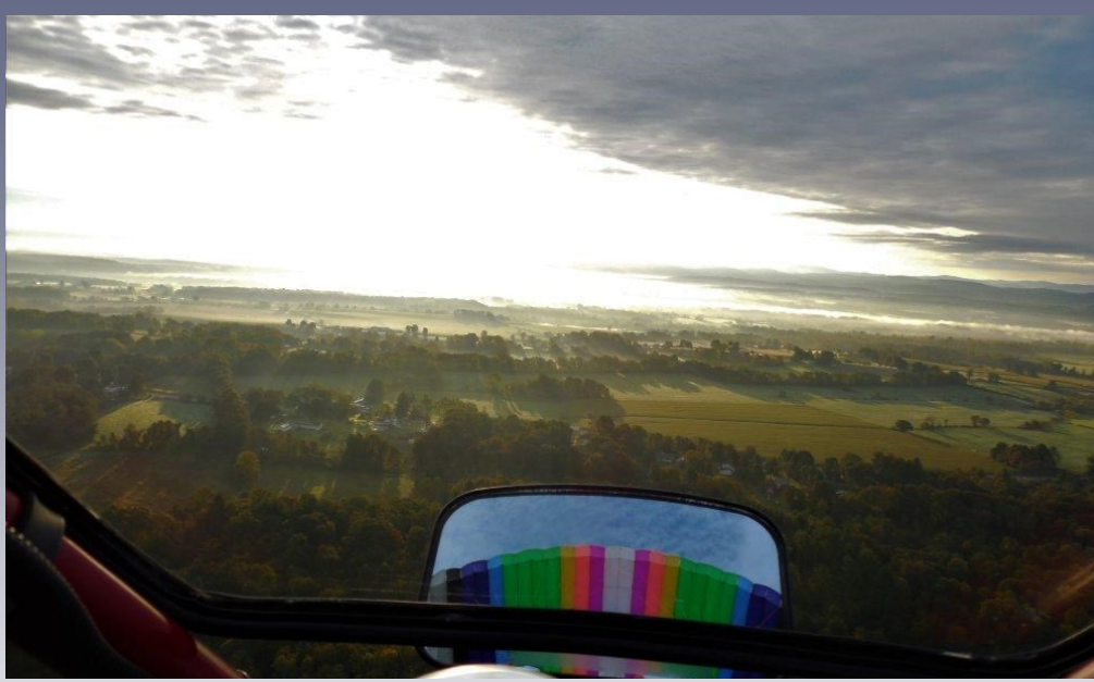
September 25, 2022 Adirondack Balloon Fest