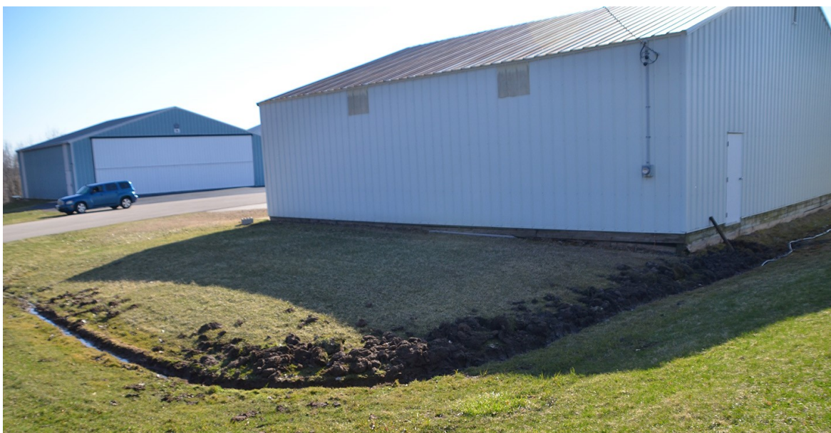
Overall view of the back side (North) of the hangar.