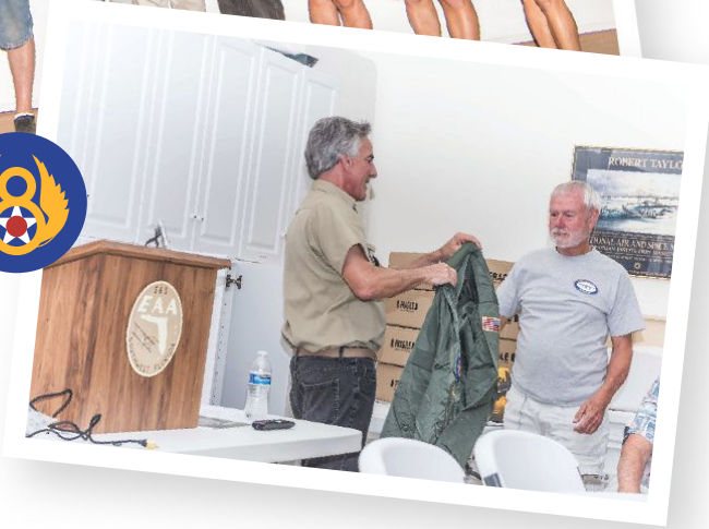
Aluminum Overcast flight jackets being presented to volunteers.

At first, all went well and the tug handled the weight of the B-17 nicely. However, once we reached the area of tight turns, the tug struggled. The stop-and-go motion put a flexing force on the tow-bar cap that finally caused it to break. Yes, it was our only tow bar. The B-17 was stranded and now blocking the only taxiway a local flight school had for getting in or out. Fortunately, they were good sports. They were very patient while we explored our options.