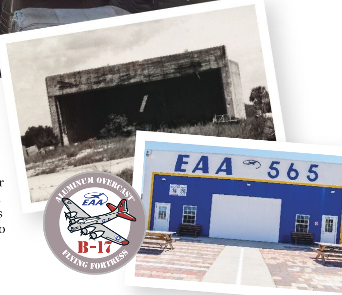
Punta Gorda Army Airfield bullet trap before and after its transformation into the EAA Chapter 565 headquarters.

The Punta Gorda tour stop was certainly shaping up to be a very successful event. The weather forecast was great, and quite a few B-17 flights were planned over the course of the weekend. The only task remaining was to wrap up some routine maintenance before tour flights started the following morning.