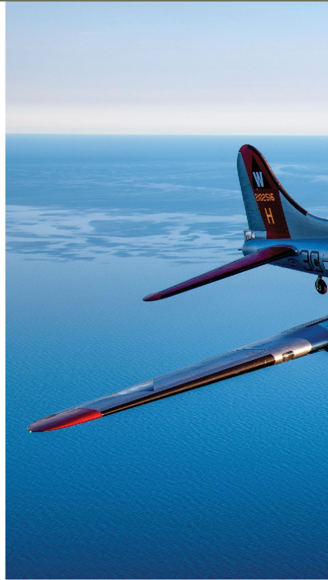
Aluminum Overcast , EAA's B-17 Flying Fortress

The B-17 was used primarily in the European theater as a high-altitude daylight strategic bomber during World War II. The B-17's primary mission was to destroy industrial and military targets that supported the Axis powers' war effort. It was initially thought that the extensive defensive armament on the B-17 would be sufficient to protect the aircraft and crew from attacking enemy aircraft. However, the threats to high-altitude heavy bombers proved to be much more formidable than originally expected. Losses of U.S. bombers were alarmingly high, especially during the early months of the bombing campaign. In all, 4,735 B-17s were lost in combat during WWII, each with 10 men onboard. A similar number of B-17s were lost in training and noncombat operations. It's truly sobering to understand the danger faced by every WWII bomber crew member. Even with production numbers as incredibly high as they were, B-17s were being lost so rapidly that the U.S. Army Air Forces inventory never exceeded 4,600. By the end of WWII, fewer than 3,700 B-17s remained in the U.S. Army Air Forces'