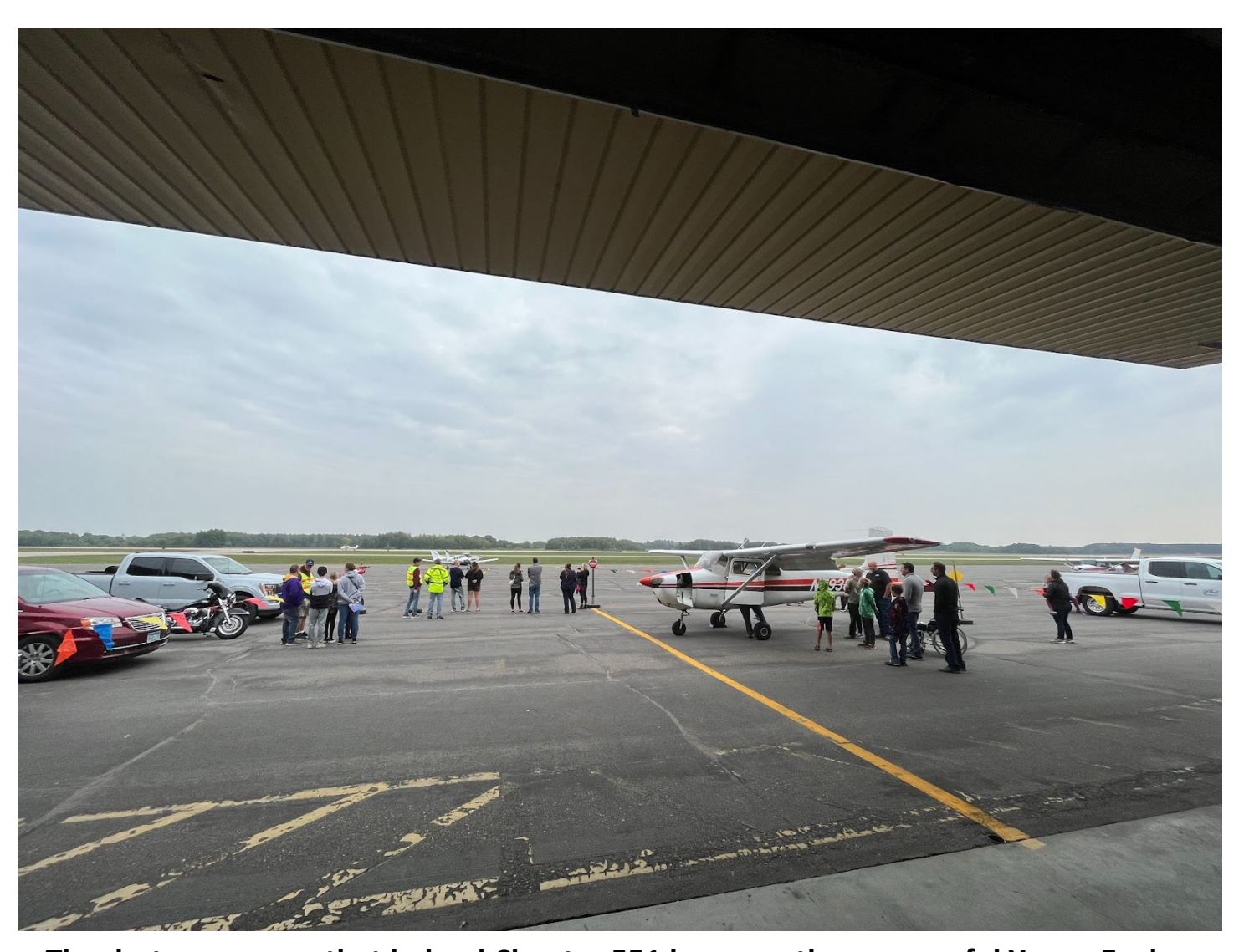
Thanks to everyone that helped Chapter 551 have another successful Young Eagles event!

What's happening around the chapter? Go somewhere cool in your airplane? Go flying with some friends?