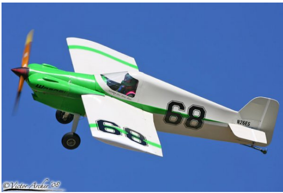
Elliot's new plane