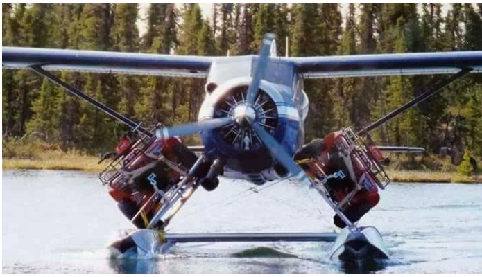
His and Hers?