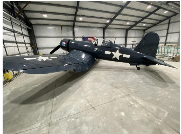
Corsair Restoration static display