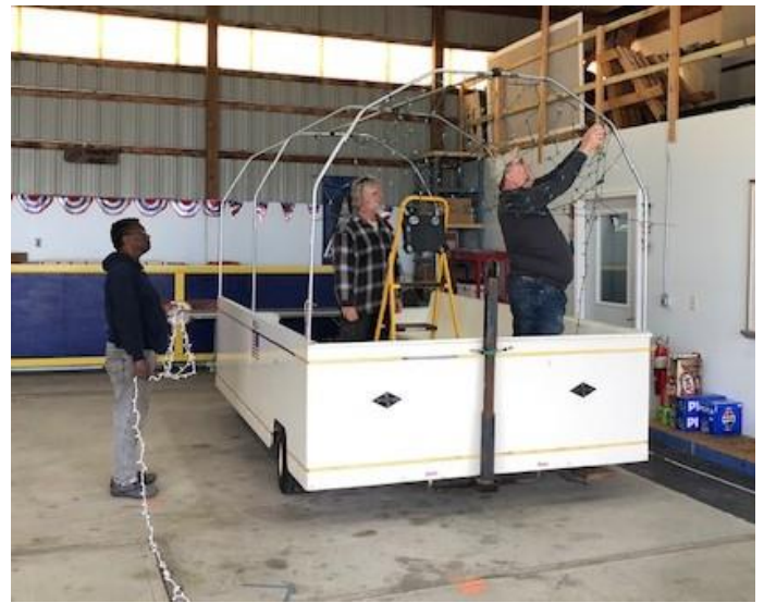
Getting the float prepped for the Mason Holiday Lighted Parade (Friday, 11/29/2024)