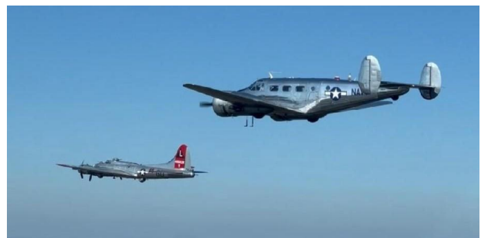
The Beech 18 flying escort to the B-17 Yankee Lady as she leaves Willow Run to a destination for complete overhaul & restoration before going to her new private owner. Michigan Flight Museum (formerly Yankee Air Museum) at Willow Run recently sold the plane from their flying aircraft collection.