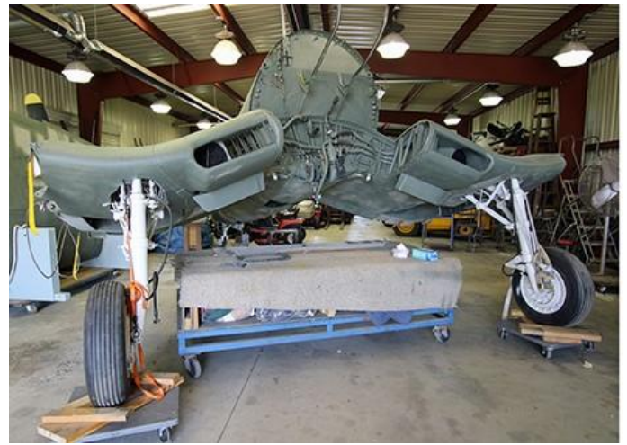
Corsair Restoration progress

First Wednesday of the second month of each quarter. The 2024 meetings will be held on February 7 th ; May 1 st ; August 7 th ; and November 6 th at 5:30pm in a classroom at the LCC Aviation Technology facility.