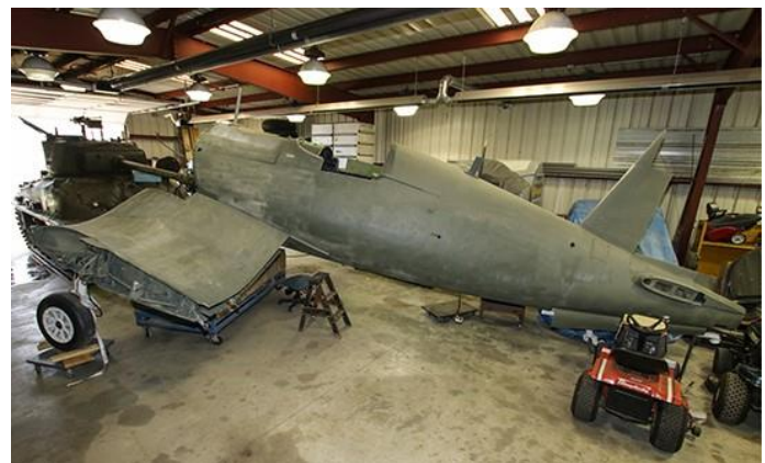
Corsair Restoration progress