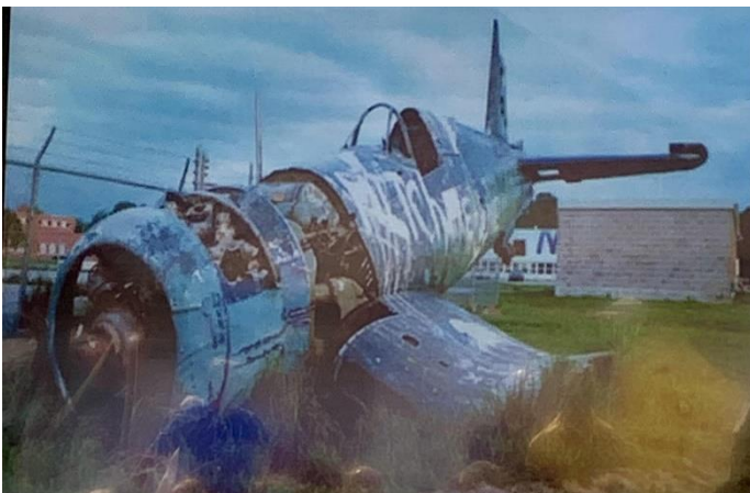
Corsair in Nebraska; May 1974