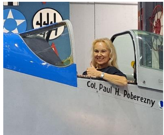
I had the privilege of sitting in the cockpit of Paul Poberezny’s Mustang. After crawling out of the cockpit, I had fun sliding down the wing to the ground.

THE EAA MISSION: To grow participation in aviation, by inspiring people to fly, build, volunteer and outreach to promote aviation.