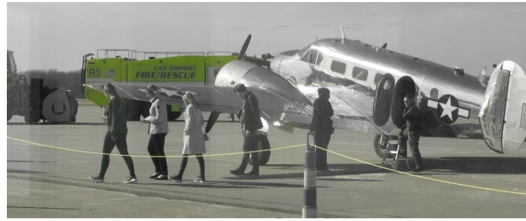
Beech 18 on the ramp