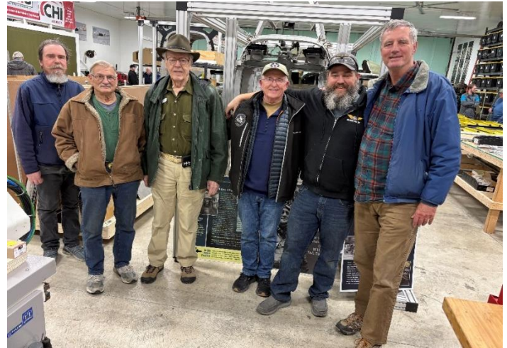
Our group on the visit to the B-25 Sandbar Mitchell project