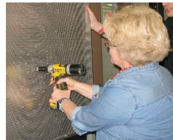
A Rosie tries out a riveter gun