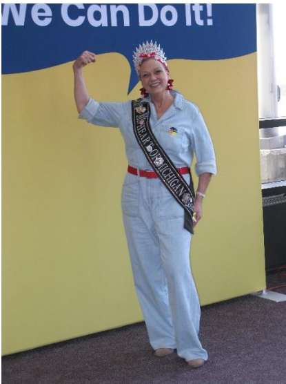
Lots of photo ops