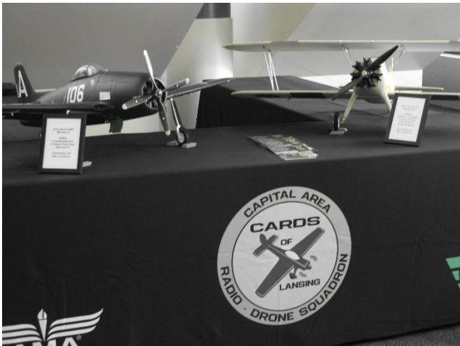
The CARDS had a great display