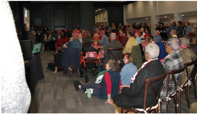
Speakers and presentations