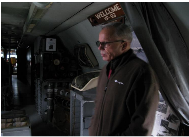
Bob Ross inside the P-3 Orion. Sonobuoy cartridges are visible in the background.