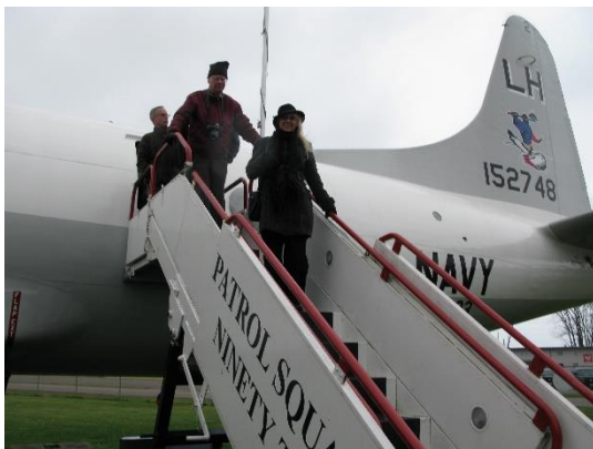
Exiting the P-3 Orion after our tour