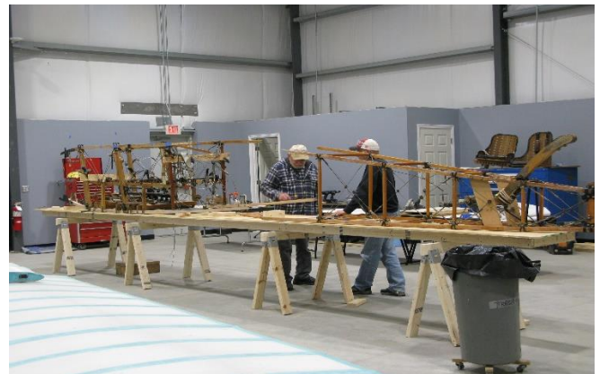
Volunteers Restoring the Jenny JN4