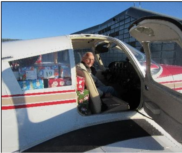
We'll miss you, buddy