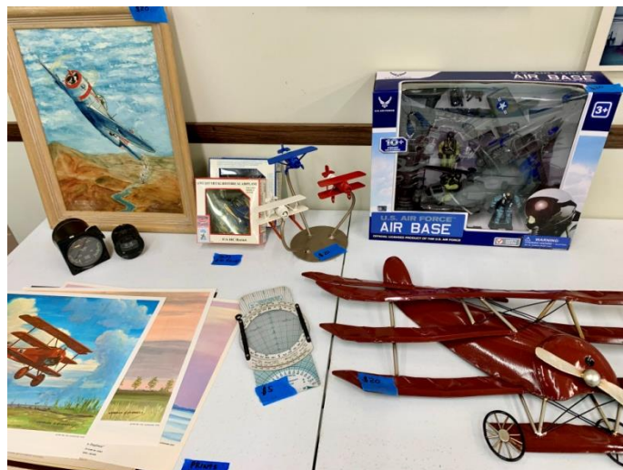
Sample of suggested items