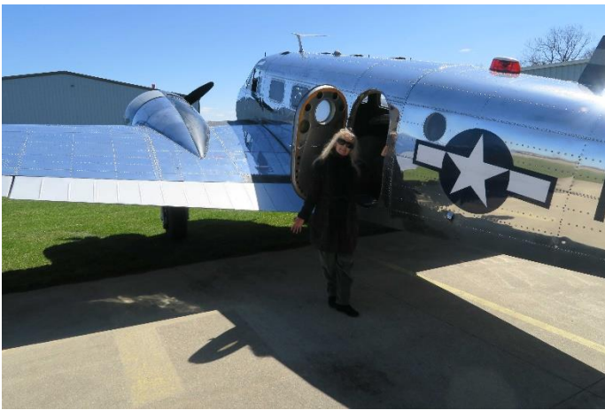
Gilda Tucker about to enter the Beech 18