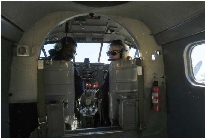
Mark Jacob and Gilda Tucker in the cockpit of the Beech 18

ATTENTION PILOTS: Please sign the Airport Register each time you make a flight whether it is to another airport or just local practice at your own airport. It is important for airport funding but also serves several other purposes. An Airport Register is located in the Mason Jewett Terminal Building and another is located in our chapter meeting room for your convenience. So, please take a minute to record your flight activity wherever you go flying – even if it's just to poke a couple of holes in the sky !!