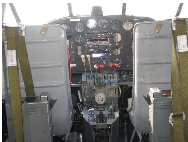
Cockpit controls of the Beech 18