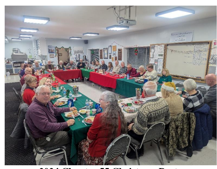
2024 Chapter 55 Christmas Party

BOARD MEETING : 7:00pm; Wed. January 8<sup>th</sup> MEMBERSHIP MEETING : 9:30am; Sat. Jan. 11th with Breakfast served from 8:00am to 9:00am