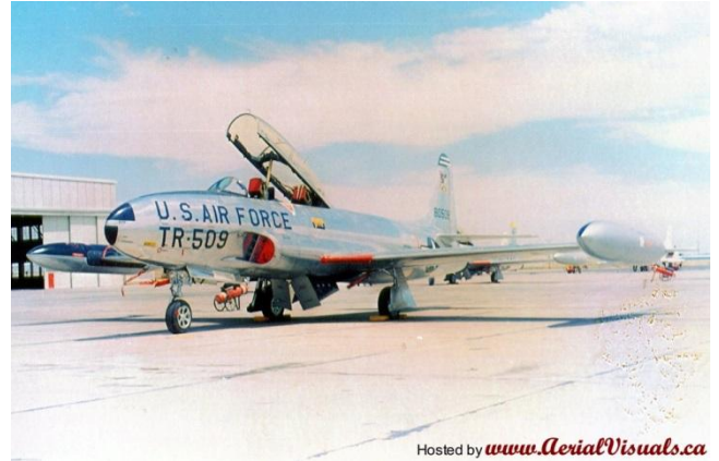
Hosted by www.AerialVisuals.ca

Photographed in service 1 August 1964 The plan is to make a few repairs before repainting. If you want to help with the repairs or painting and also Looking for someone to manufacture and install engine intake plugs. Contact Dave Trojan at dtrojan60@gmail.com for more info.