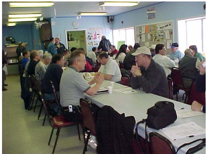
March breakfast meeting

Don't get any wires crossed, do some smoke tests on your electrical system before you go flying, and as always, don't forget to help your fellow aviator when they need it.