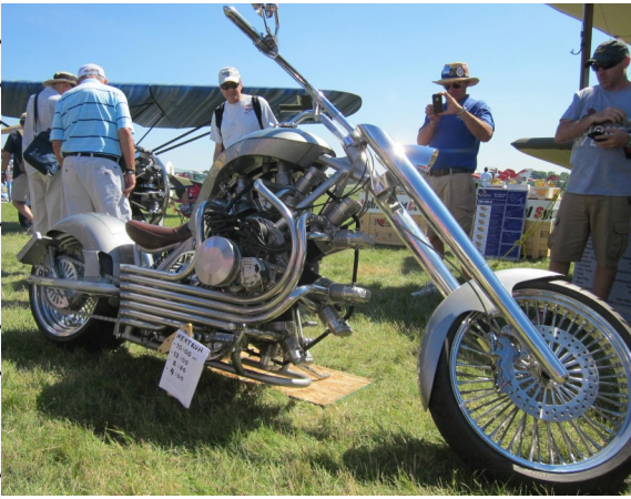
(Airventure) Someone put a Rotec Radial Engine in a motorcycle. It had no mufflers and when they started it—whew, it was LOUD.