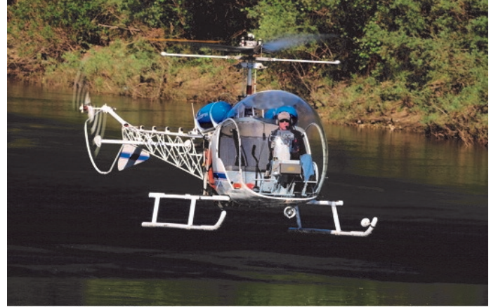
According to Scott's – Bell 47, the announcement of the Bell 47's return to production has been greeted with enthusiasm by customers.

ized dealers for exports Scott's acquired the the Model 47 in 2009 nounced its intention to turbine-powered varitial target price of anticipated to begin in is scheduled for the SB47 general manager pany plans to submit a FAA later this month. factory support and reety of upgrades, for the still in service worldannounced a deal with sive distributor for that pistons for the discon-