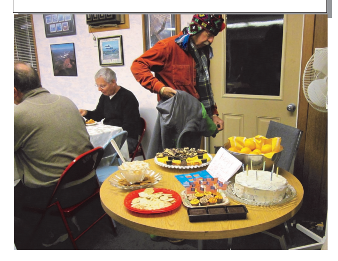
The desert table at the Chapter Holiday Dinner. All the deserts were brought by members and guests to share.