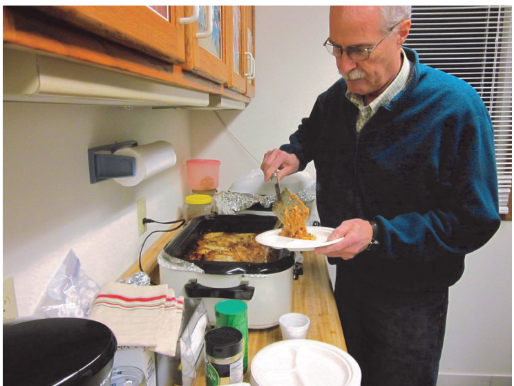
Left. Another member serving hot lasagna at the Chapter Holiday Dinner and Recognition night.