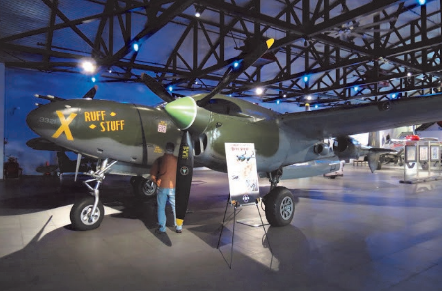
More Photos From the Fagen Museum