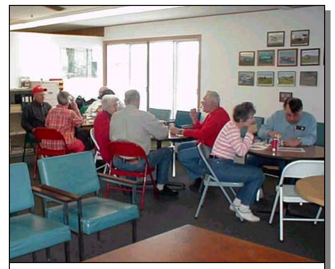
Join other members of Chapter 54 for a pot-luck dinner. The next pot-luck will be on Friday June 14 at 6:30 in the Chapter House.