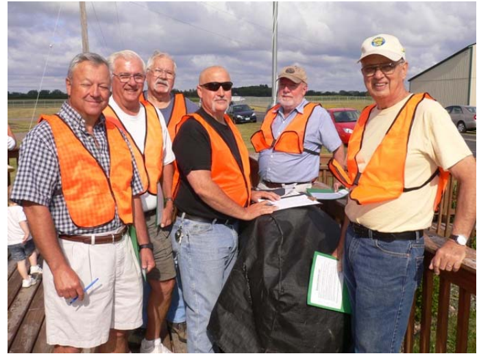
Our Young Eagles ground crew that day

At Airventure 2007, I took part in the Young Eagle coordinator activities and seminars that were both educational and inspiring. EAA puts a tremendous amount of energy and resources into the Young Eagles program. I am excited about a new program for Young Eagles that will take them beyond their first flight. It is an "EAA Student Membership" which includes a members-only website, scholarship money, weekly e-newsletter, EAA discounts, education programs and more. You will be hearing more about this new EAA membership for kids in the future.