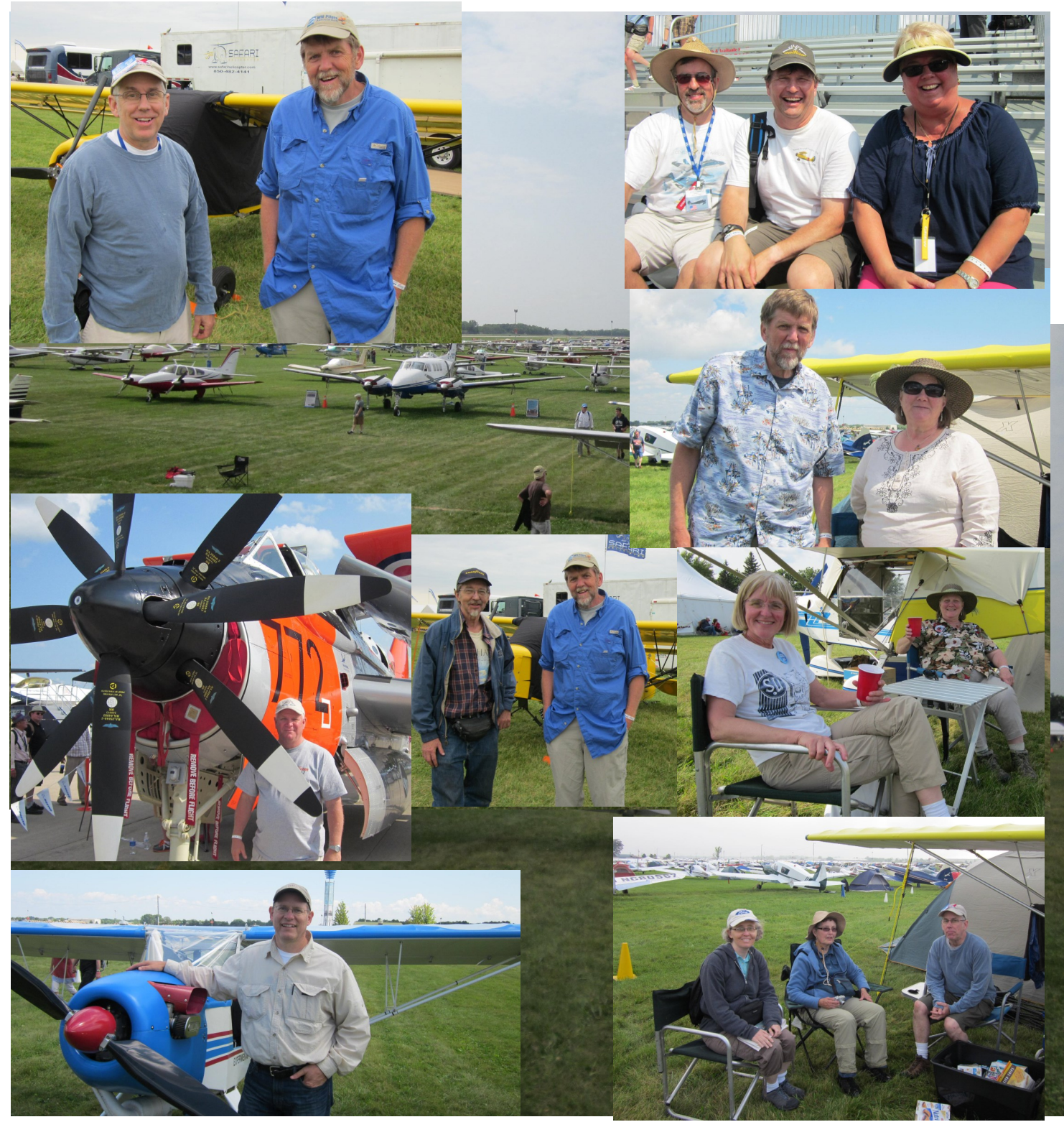
Members shared their observations and experiences at Oshkosh AirVenture 2014