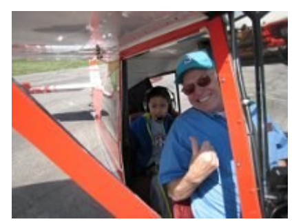
EAA CHAPTER 54 THE BEACON