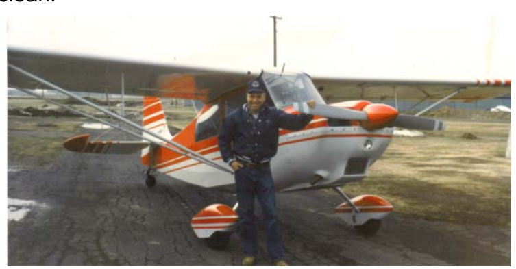
This picture taken on 2/25/86 when I first picked up the airplane with on 436 hours on it!

Citabria 7GCBC to which I always try to keep clean.