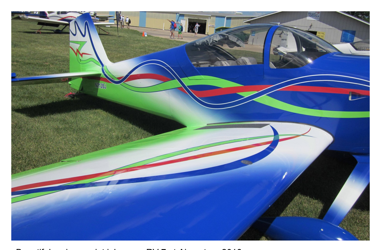
Beautiful, unique paint job on an RV 7 at Airventure 2016

Look for an email from me soon asking for your cold weather flying tips and stories for January's meeting. Please start thinking about any tips or stories you would like to share about your cold weather experiences in the past or currently in the making!