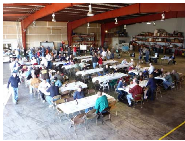
These two pictures above show the cooking area and the seating area