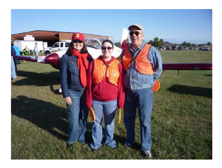
These two pictures show the aircraft parkers