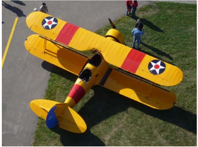
A couple of very nice aircraft in attendance that day