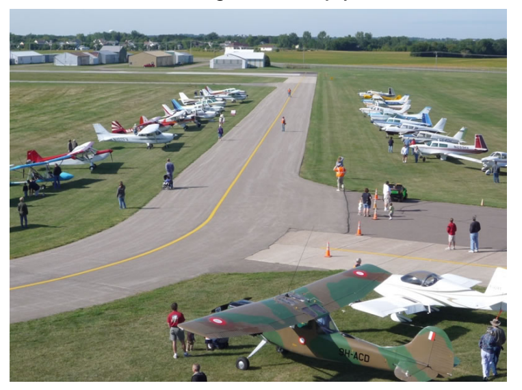
High up picture taken from the fire truck showing the west flight line.

Below is a bunch of pictures that were taken from the website, <a href="www.eaa54.org">www.eaa54.org</a> from the gallery section that tell the story of that morning. Some have subtitles describing them. Enjoy: