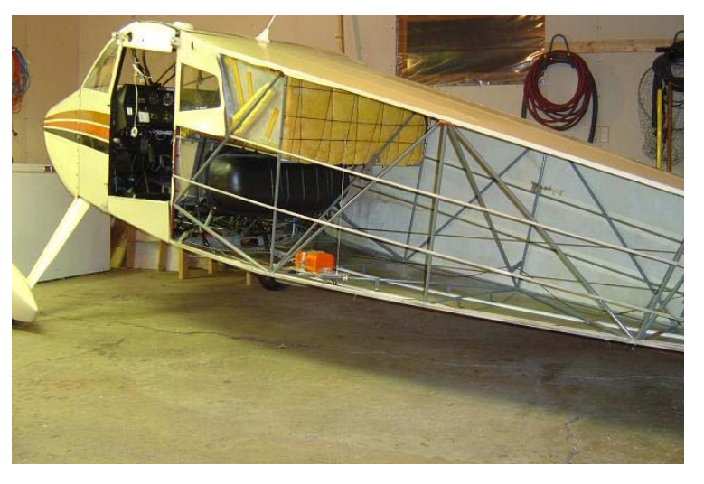
November 2006, removing the old fabric.