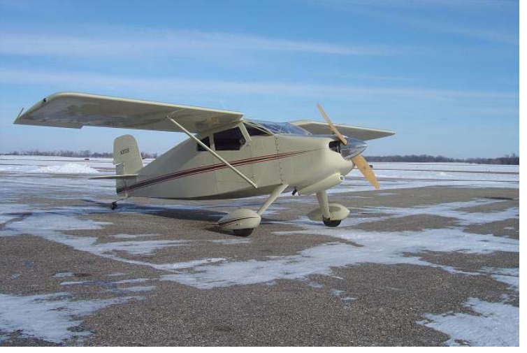
Jan 4, 2008. First flight after recovering.

My W-8 Wittman Tailwind flew again on January 4, 2008 after spending 14 months in my garage. Like so many other projects I have done, this one took a little longer than planned.