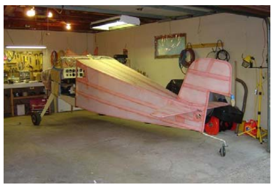
May 2007, Finishing tape going on .