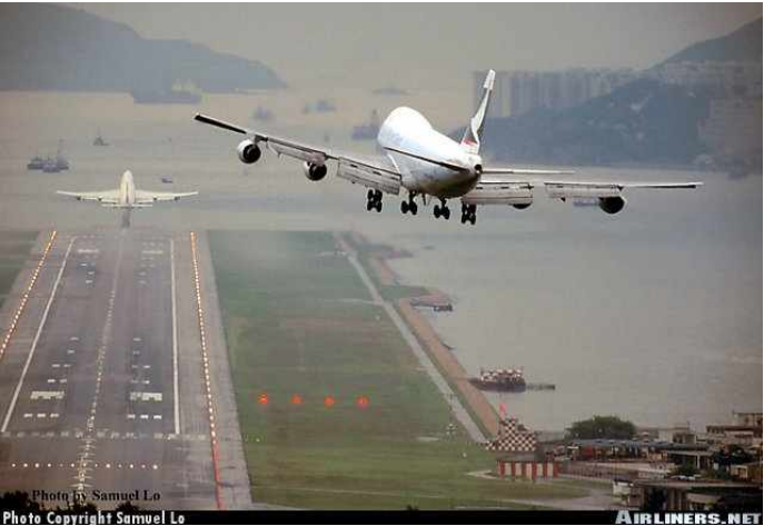
(Continued on page 8)

First one to see it calls "Checkerboard in sight"...!!