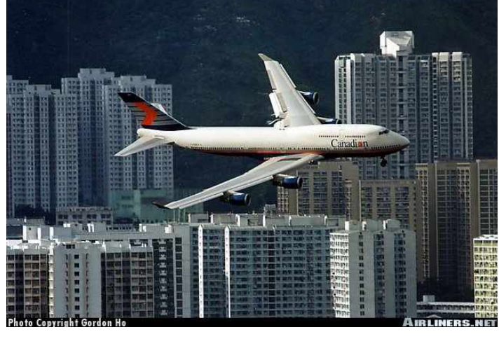
At ILS "Minimums"...you break out of the clouds at the top of a hill..!!!

First one to see it calls "Checkerboard in sight"...!!