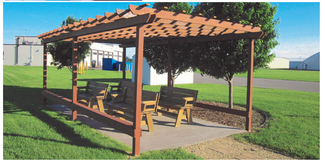
The new pagoda at the airplane viewing area. Thanks to the crew who salvaged the lumber, cut, trimmed, assembled and stained the wood.